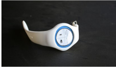
Figure 5. The Control Unit used as a smart watch.

encounter the patient. The third party will then know what immediate actions must be taken before the patient is taken to the hospital. The device provides auditory assistance to the visually impaired, a list of profiles for insulin therapy based on the need of the patient, and a log of recent glucose checks, and insulin amounts delivered.