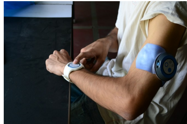
Figure 4. Usage scenario of the Control Unit.

advantage of having a dedicated platform for such tasks is that it cannot be tampered with by mistake. Tasks like insulin delivery and glucose checks can be completed by setting the data on the Control Unit, and pressing the blue buttons on the IAD for the actuation to commence. Here I had consciously decided to keep the final actuation tasks to be completed by the blue buttons on the IAD, because the task of insulin delivery can be fatal if taken without needing insulin in the body. Hence while the entire process is touch based, it is important to get haptic feedback while conducting an insulin delivery.