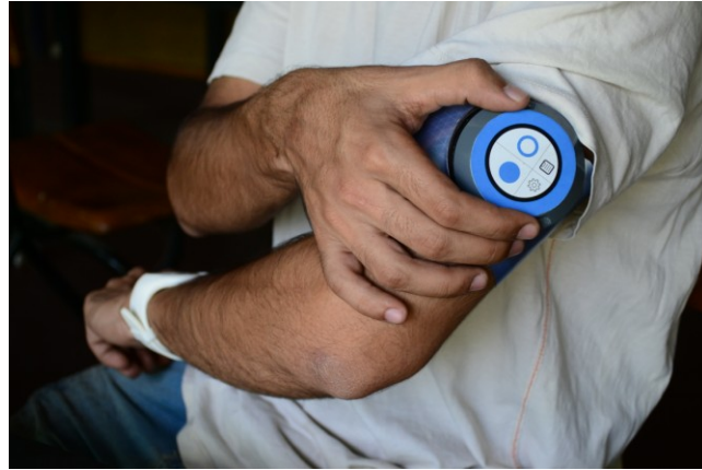
Figure 3. Usage scenario of the IAD

encounter the patient. The third party will then know what immediate actions must be taken before the patient is taken to the hospital. The device provides auditory assistance to the visually impaired, a list of profiles for insulin therapy based on the need of the patient, and a log of recent glucose checks, and insulin amounts delivered.