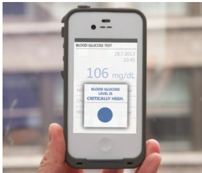
Figure 6. Insulin Management Application

The Control Unit (as shown in Figure 5 ) is a small, discrete device that is the size of a watch dial and can be worn as an accessory (a pendant, a watch). It is required because most of the time, the IAD is present on the skin, under the clothes, and hence unreachable in a public environment. The device contains a single finger touch screen and a blue scroll ring for navigation. The screen conducts a finger print scan to unlock, and also to maintain the single identity of the user. It is easy to use, with only dedicated functions, and helps transfer data from the IAD to a personal computer from where data can be sent to the doctor concerned for real time monitoring of the patient's condition. The